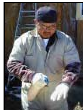
Spray gloves before taking them off