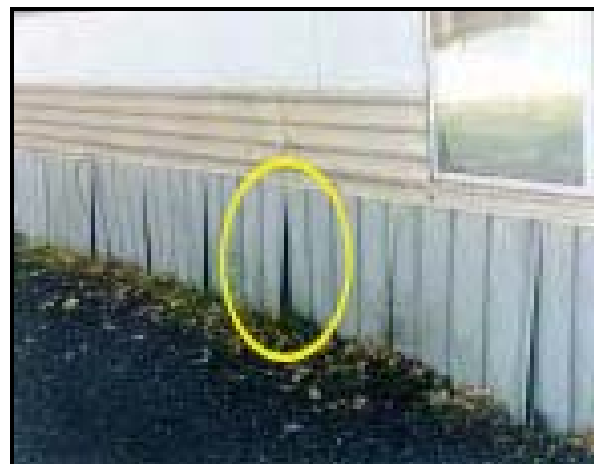
Fix gaps in trailer skirtings