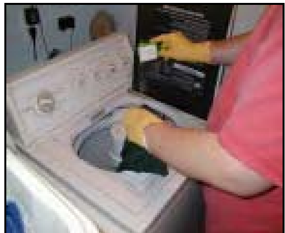
Wash clothes and bedding with detergent in hot water